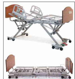
Basic American Medical Products Zenith®9000 Bed