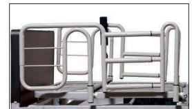
Half No-Gap Head Rail (GF6590B-1)