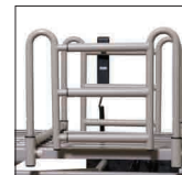
Quarter Rail (GF6580B-1)